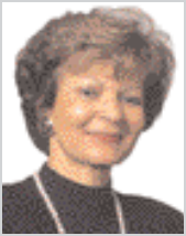
Hazel O'Leary President O'Leary & Associates