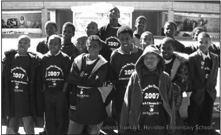
Students from A.E. Herndon Elementary School.

The next stop was the King Non-Violence Center, where the children enjoyed reading about King's early inspirations such as Gandhi and Rosa Parks. They were also able to learn